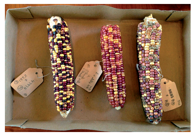
Fig. 3.— Different corn cobs used as study objects

When McClintock introduced her idea of jumping genes in 1951 during a symposium in Cold Spring