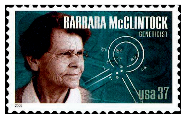
Fig. 5 .- Stamp dedicated to Barbara